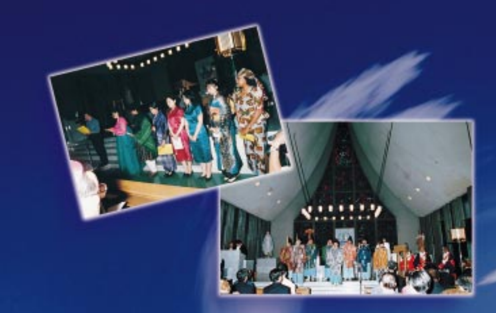
Inter-Religious Gathering by World Council of Churches (WCC) during COP 3.